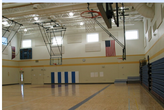
Our gymnasium is great for sports practice, tournaments, aerobics or larger group events.