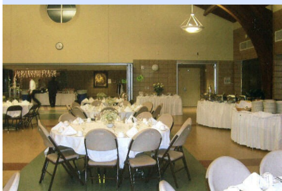
Kohler Hall, our new event area, seats 200-300 people and is ideal for wedding receptions, banquets and seminars.

A large part of the renovation included the addition of a state of the art kitchen, gymnasium, community room and classroom facilities. Beyond parish and school activities, St. Mary of the Lake is open and welcome for community use.