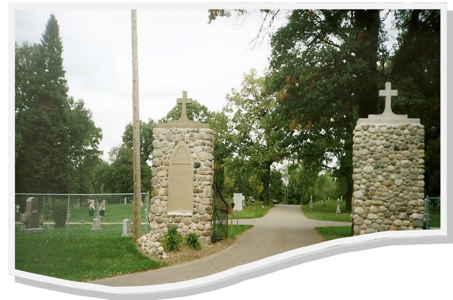
Stillwater Street (One block east of Otter Lake Road) White Bear Lake, Minnesota